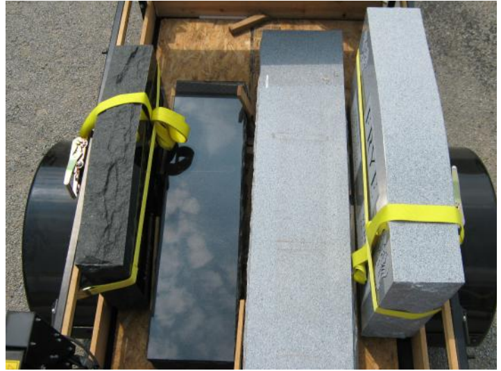
These two double stones weigh 2625 lbs. Max payload is 2800 lbs.